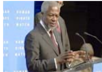
Kofi Annan – Former UN Sec. General