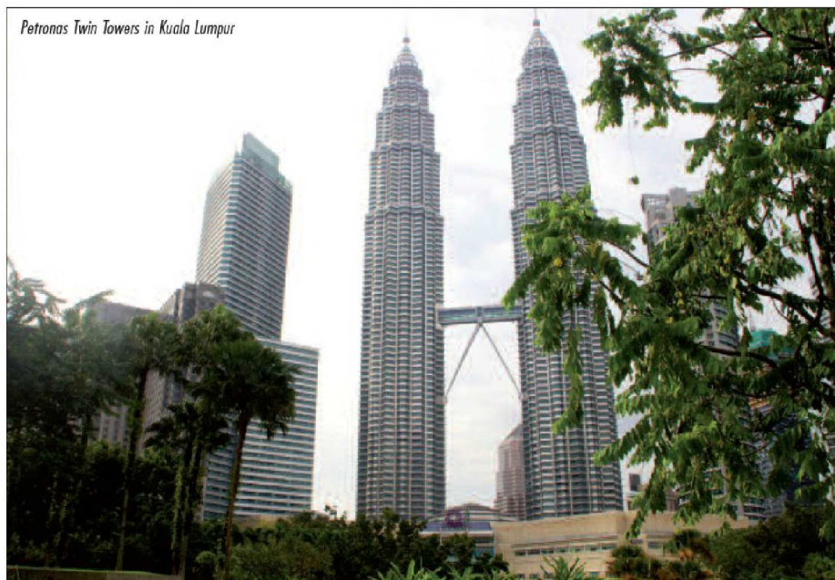
Petronas Twin Towers in Kuala Lumpur

Engaging the Challenges, Enhancing the Relevance