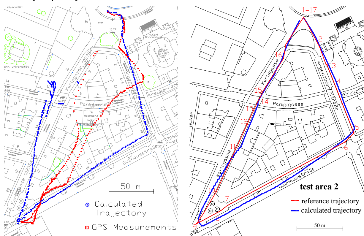
Figure 3. Urban test area in the 4 th district of Vienna with DRM III trajectory (left) and NAVIO multi-sensor system trajectory (right)

positions of the DRM III module. Due to bad satellite reception along the Karls-gasse and the large positioning errors of the GPS receiver, the DRM III system is not able perform a continuous position determination from the start point in the Ressel-park (in the north) to the same end point as in the Karls-gasse the drift of the dead reckoning sensors is to large and no update from GPS is available. On the other hand, Figure 3 on the right shows the result of our calculated trajectory using the new multi-sensor fusion approach. As can be seen from Figure 3 (right), a continuous position determination is possible using all suitable sensor observations. Also the positioning accuracy of the determined trajectory is much higher. The maximum deviation from the reference trajectory in the range of 7.5 m occurred only at the intersection of the Gusshausstrasse and Karls-gasse. A further improvement at sharp turns is expected by using the improved Kalman filter approach mentioned in section 3. The refined approach will take also sudden changes in the direction of motion of the pedestrian into account [compare 1].