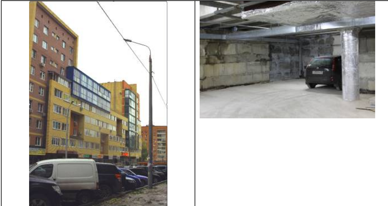
Figure 2. Some photographs showing the apartment complex with its underground parking