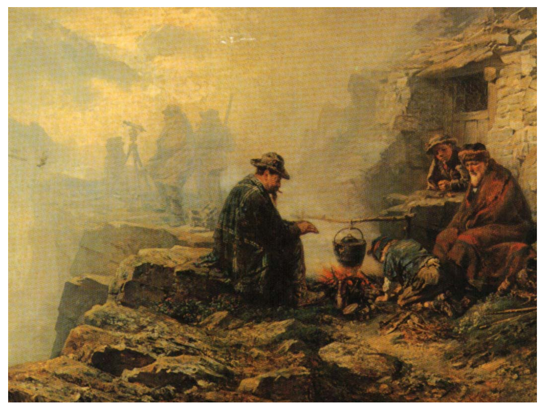
Raphael Ritz, 1880

When we move though the landscape and over mountains – with maps or with GPS receiver – we hardly imagine the work and troubles of surveyors making the measurements and drewing these maps hundred and more years ago. In the age of Internet, GPS, communication satellites and geo data infrastructures the desired information about topography, landscape, traffic ways, food supply possibilities comes at any time and everywhere to us. The desire for such information is old. First plans are old thousands of years ago. Who possessed plans, could prevail over countries and trade routes. Long time maps were secret. Exact maps became only possible, as in 18th and 19th century precise surveying equipment and measurement procedures were developed. With heavy devices the pioneers of the alp topography climbed on the mountain summits and – often under extreme weather conditions – accomplished their complex measurements.