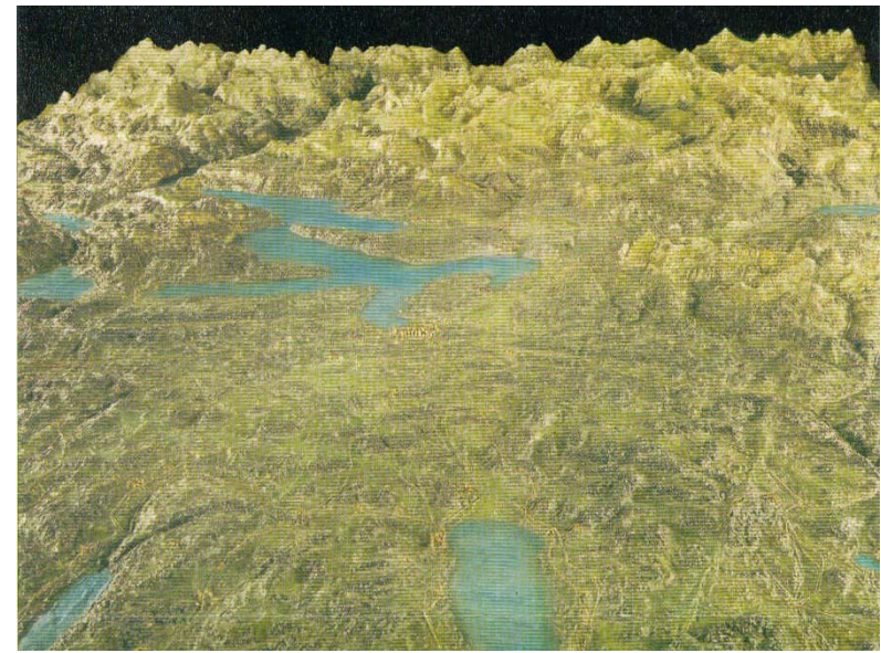
Franz Ludwig Pfyffer