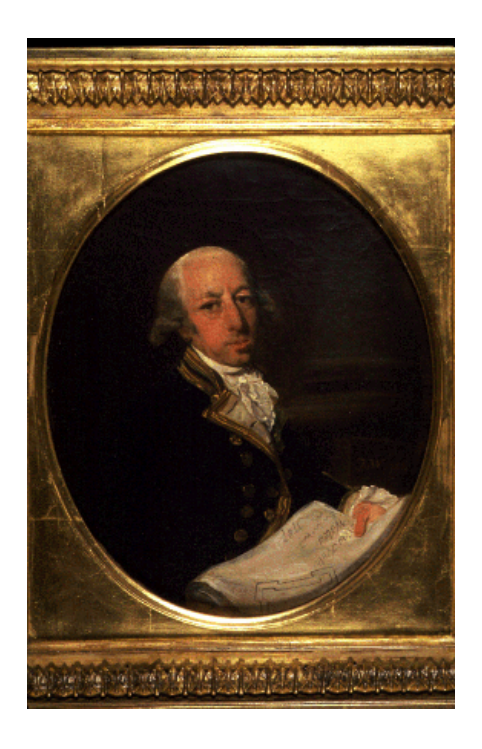
Figure 1. Portrait of Arthur Phillip

the First Fleet which was made on 12 October 1786, one day after his forty eighth birthday.