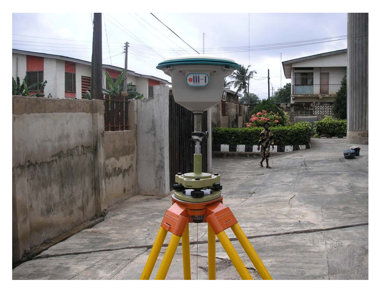
Fig. 3. Picture showing the Sokkia Radian IS Dual frequency Integrated GPS in 2006.