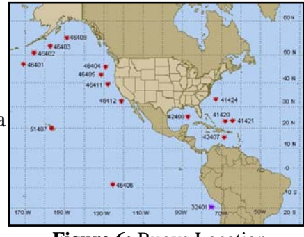
Figure 6: Buoys Location

To expand the U.S. tsunami warning system, NOAA has installed five deep-ocean assessment and reporting of tsunami (DART) buoy stations off the U.S. East and Gulf coasts and the Caribbean. The latest buoy station, off the coast of Louisiana, joins stations off South Carolina, Florida and two off Puerto Rico installed in March 2006. These buoys are a first line of defense in providing citizens of the Atlantic, Caribbean and Gulf regions with a comprehensive tsunami warning system. DART stations are an advanced technology that will help protect densely populated tourist