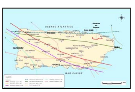
Figure 4: HurricaneTrayectories

in the Caribbean. Since 1893 there have been 9 hurricanes that have passed directly through - out the island, see Figure 4. As these storms pass, they leave large amounts of destruction and rainfall. These are major problems for the island because the activity of hurricanes lasts from June through September (4 months). The process of Recovery and stabilization has a slow start as the Municipalities try to recover rapidly with their mitigation and management programs.