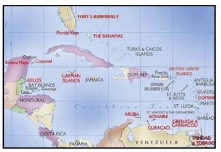
Figure 1: Caribbean basin

Puerto Rico is an island between the Caribbean Sea and the North Atlantic Ocean, east of the Dominican Republic and west of the Virgin Islands (about 1,000 miles (1,600 km) southeast of Miami, Florida), see Figure 1. Based on the Caribbean Plate and bordered on its northeast side by the North American Plate. Surrounded by multiple gravitational anomalies caused by multiple ocean trenches and deep waters fringe Puerto Rico. The Mona Passage, which separates the island from Hispaniola to the