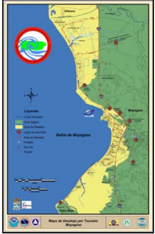
Figure 5: Tsunami Map

One of the main components to register tidal changes in actual sea levels is a tide gauge. Different mechanisms have been developed during this century to measure these changes; among these are pressure, electronic and float sensors. Computers are integrated to these sensors to collect data, perform local data analysis and broadcast through Geostationary Operational Environmental Satellites (GOES) or by internet connection to the nearest Tsunami Warning Center (TWC) in case of abrupt changes. If this occurs, the alert will be automatically activated and the real time data