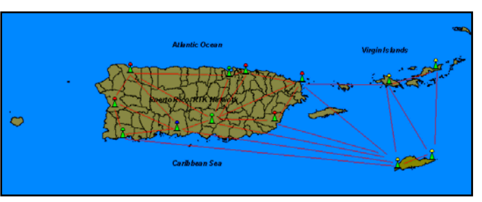
Figure 7: RTK Distribution Concept

Real - Time Global Navigational Satellite System (GNSS) is the most important growing technology in the world's positioning market. More cost -effective projects, reliable data, real time or post processing centimeter accuracy, data archive among others are only some of the benefits of RTKN.