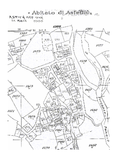
Figure 3 . Typical cadastral map of an urban area in the island of Kos, Greece. Such diagrams will be scanned, digitized and georeferenced within the scope of the project: "Digitizing the Dodecanese Cadastre" in order to be used as evidence in a subsequent procedure of incoperating the Dodecanese Cadastre into the Hellenic National Cadastre.