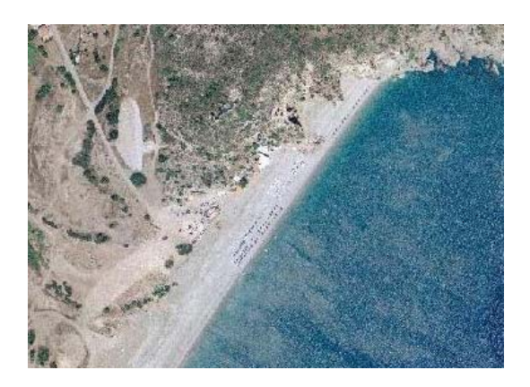
Figure 7 . Typical sample of a high resolution color orthophotomap that will be used (in enlargement) for the delineation of the shore.

The budget of the project is 3,4 million Euros and the time horizon for its completion is the end of 2008.