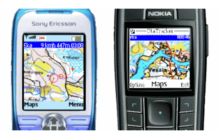
Figure 4. Two different mobile phones using service for locating hunting dogs

Ultrapoint is a company (<u>http://www.ultrapoint.fi/</u>) specializing in products based on high-frequency radio technology and system solutions for wireless data communications. One of these products is software for a mobile phone and a dog collar fitted with a GPS/GSM-based tracking device which together enable a hunter to track the movements of his dog. The software uses the NLS software interface to download background maps to the mobile phone either before each hunting expedition or as required. The location of the dog is displayed on the map (See Figure 4.)