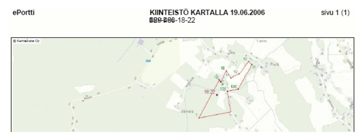
Figure 6. Real estate boundaries on a map printout

The Eportti service utilizes the software interface for cadastral data to produce property boundaries and boundary marks on map printouts, something which was not possible earlier. (See Figure 6.)