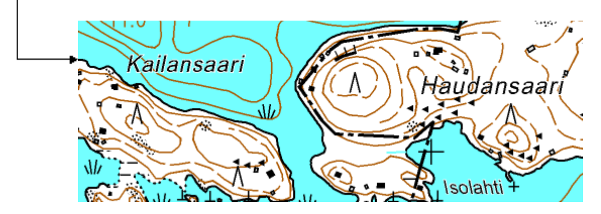
Figure 2. Example GetMap query and result of the query

The latest service and data descriptions are available at: http://xml.nls.fi/