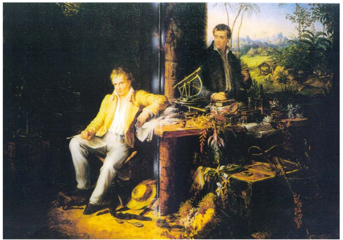
Alexander von Humboldt, 1800.

Gauss came to speak on the coincidence, the enemy of all knowledge, whom he had always wanted to defeat. From the proximity regarded, one sees the infinite refinement of the causal fabric behind each event. If one withdraws far enough, the large samples revealed themselves. Liberty and coincidence are a question of the middle distance, a thing of the distance.