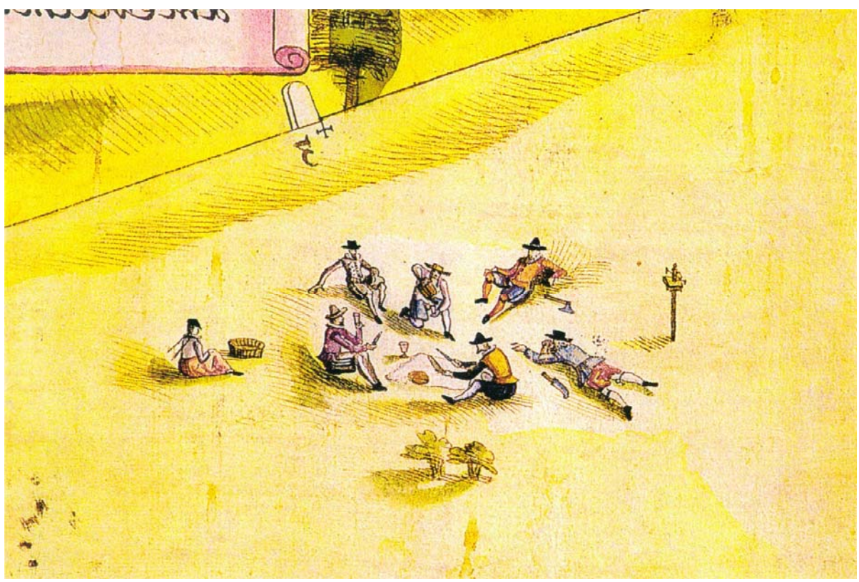
Detail from a map.

Rolf Bolderwood: Robbery Under Arms (1888)