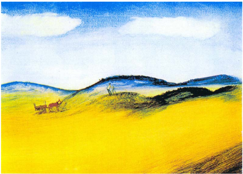
Pro Hart: The First Surveyor, 1974.

Andrew Barton Paterson: The First Surveyor (um 1900)