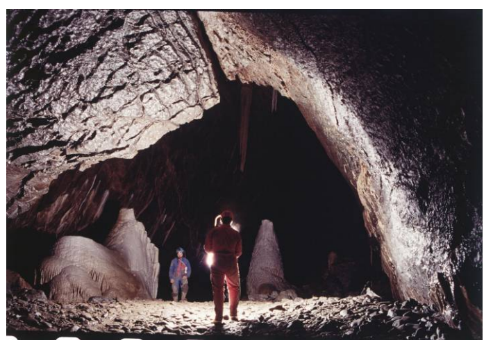
Potok River started in 1992. In the same year, a new survey of Amaterska Cave was also begun.

One of the last unsolved problems of Moravian Karst was the connection between Amaterska Cave and the Sloupsko-sosuvecke Caves. In 1989 a sump at the end of Sloupsky corridor was dived through and around 1500 m of new corridors were able to be explored. The way to the Sloupsko-sosuvske Caves was blocked again by the sump. The Pusty Zleb Caving Club concentrated its activities on solving this problem in 1987 when digging works in Sloupske Vintoky cave started. A massive research of an underground passage of the Sloupsky