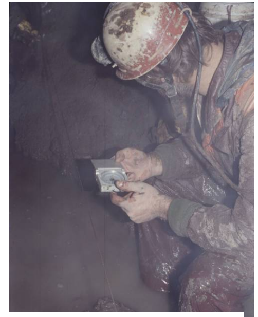
Survey in hard accessible muddy passages in Sloupsky corridor of

Shaping the Change XXIII FIG Congress Munich, Germany, October 8-13, 2006