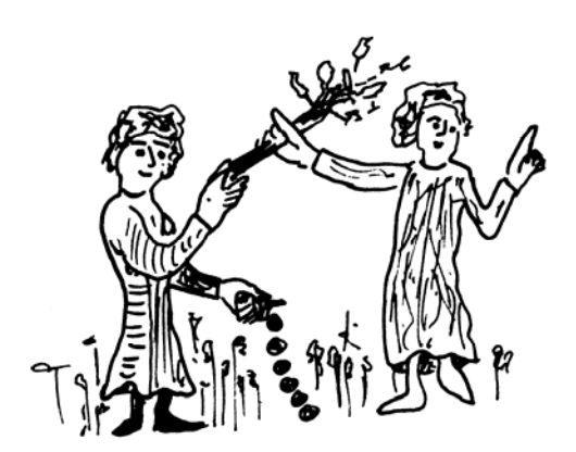
Figure 2 Handing over a twig as a symbolic act for transfer of land (Dekker 1986a: 4)

blade from the land to the purchaser (Dekker 1986a: 4, Figure 2). It is not only important for both parties to be aware of the transfer, but also for the other people ('the rest of the community'). Barry (1999) identifies that community knowledge includes either witnessing or verbal affirmation of a contract. This works well as long as a community remains close knit, and transfers are infrequent, but gives problems when a community gets larger or less coherent, and when memories grow dim.