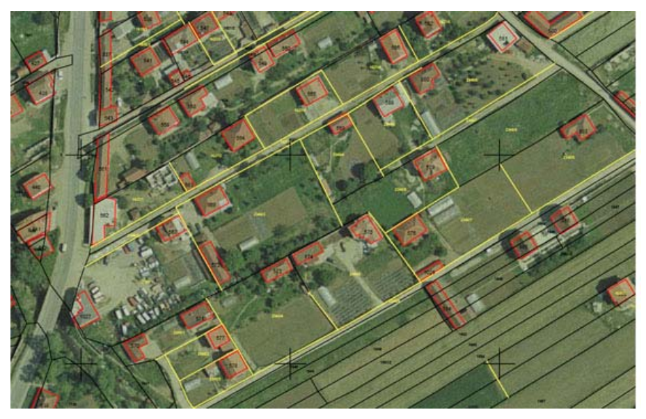
Fig. 5. Cadastral data from digital Orthophotos 2004

The Orthophotos below as digital cadastral and spatial records has to be made available on WebGIS fig.5.