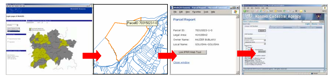
Fig. 4. Link of database and presentation

Application user's access right to the e-cadastre is at different level such as: