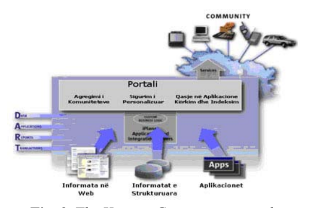
Fig. 2. The Kosovo Government portal

The system of e- governance is to be supported by Portal which is shown on fig. 2.