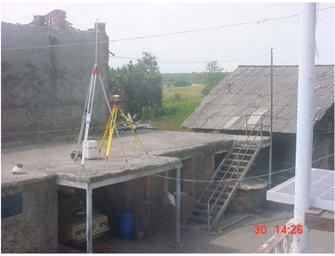
Picture 2. DPT-base station on a temporary fix point in the field office of the surveying squad