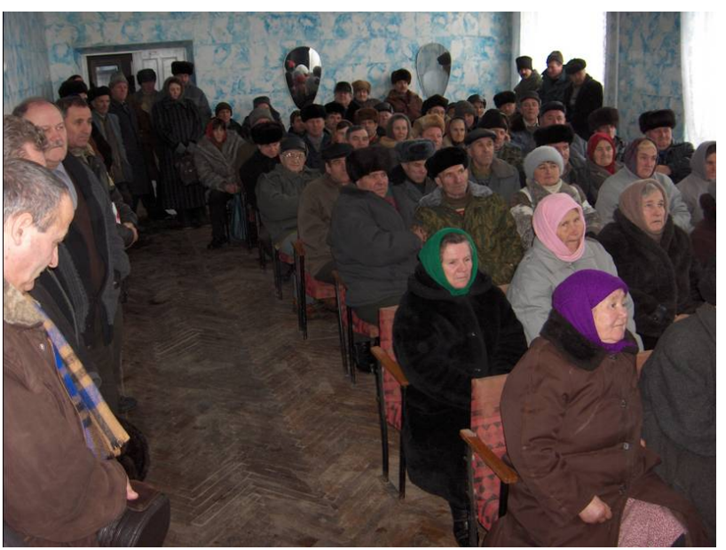
Landowners and local stakeholders from Bravicea village, Moldova. Clear interest for a land consolidation pilot project but it most be seen in a braoder rural development context (February 2005).