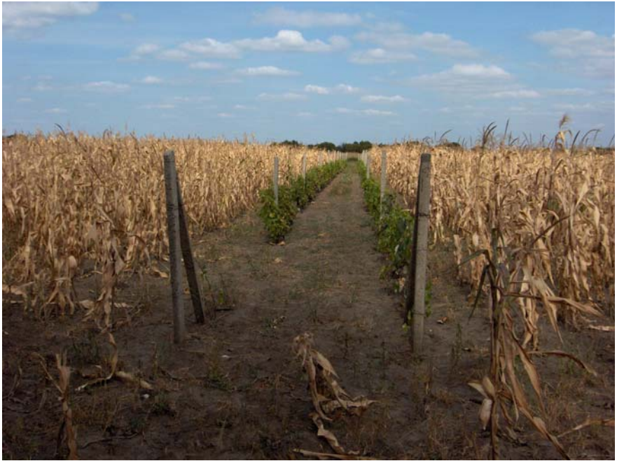
Small and fragmented parcel in Copanca Village, Moldova (September 2005).

Most of the countries (twelve) are somewhere in the process with preparation or implementation of land consolidation pilot projects or have already implemented pilots (see section 4). Most of these countries have already or are at the moment preparing a national land consolidation strategy. It is worth to mention that countries such as Hungary, Estonia, Latvia and Albania have had pilot experiences some years ago but the process seems to have stopped. The reason for this varies from country to country, but change in Government and budget cuts are important reasons. In Latvia for example, land consolidation has not been a political priority and the present Government relies on the land market to solve the structural problems in the agrarian sector.