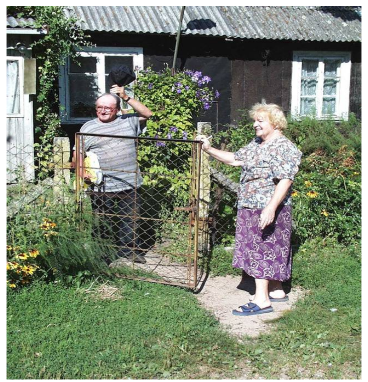
Happy landowners – the best indicator for success (Lithuania 2003).

It is the objective of the exercise through a participatory approach to seek and reach consensus in the community about the proposed changes in the land use / area development plan. The output of the project activity is the community area development plan with immediate, medium- and long term measures for local development. The subsequent land consolidation projects will not fully implement the area development plan but they will support the immediate changes of land use and try to re-structure the owner- and user structure to the identified measures for local rural development.