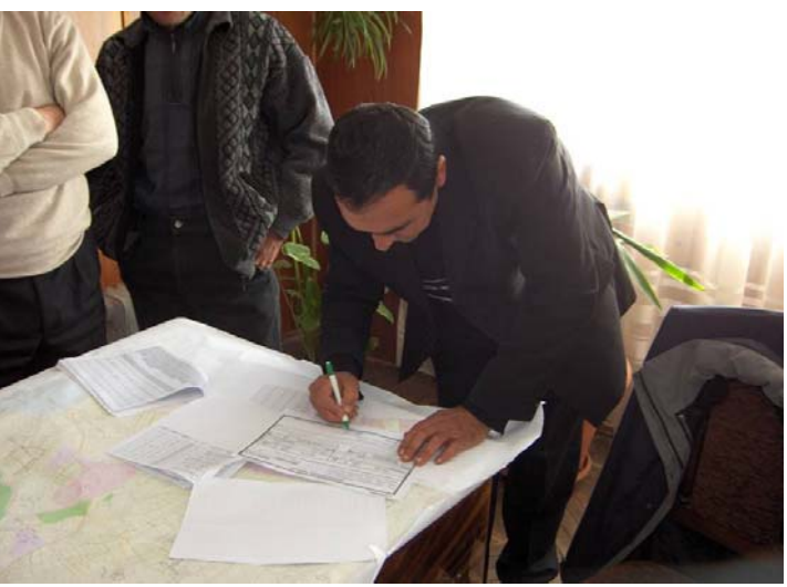
Signing of the first land consolidation agreement in Armenia (November 2005)

It is characteristic, that the FAO TCP projects are implemented mainly by local experts and only with a limited input from FAO experts and international experts.