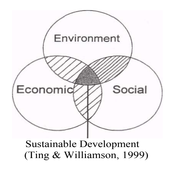
Figure 1: Balancing economic, environmental and social forces for Sustainable Development.

Generally speaking, development incorporates economic, social and environmental factors within a framework of institutional, political, legal and technological systems conducive to decision-making. These economic, social and environmental forces need to balance against each other to create an "intersection" conducive to sustainable development.