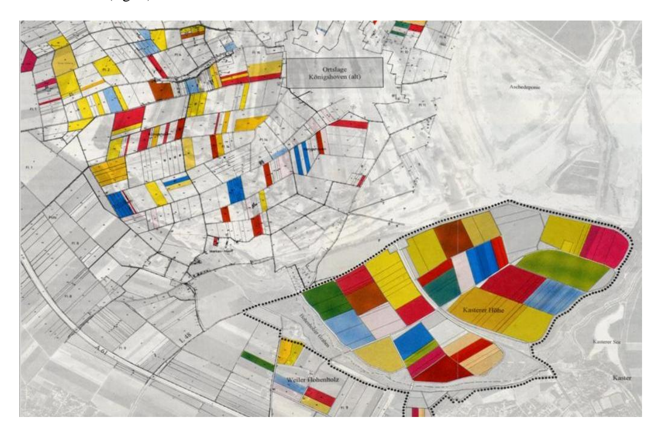
Figure 6: Outcome of the land consolidation procedure (old and new parcels)

The overall positive effect on farming structures may be seen by comparison of old and new plots of several private owners: to shorten the period of land-usage agreements the owners of parcels in the forefield of the mining receive their compensation in an area already under recultivation (fig. 6).