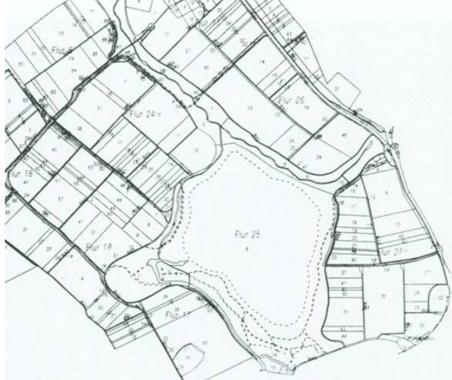
Figure 4: Road and Water Resources Plan with landscape conserving accessory plan