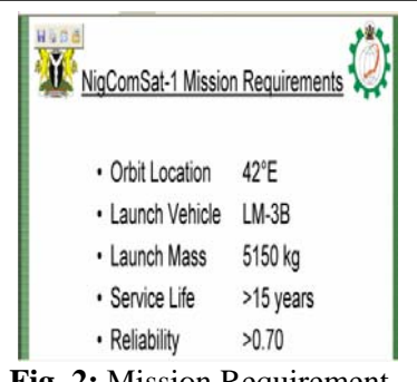
Fig. 2: Mission Requirement of NigcomSat-1 (www.nasrda.org)