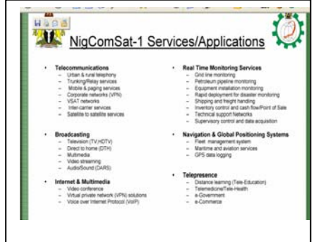
Fig. 3 : Services/Application of NigcomSat-1 (www.nasrda.org)

iii. In 2001, Nigeria witness a greatest revolution in its information and communication technology sector with the grant of license of operation to private telecommunication companies like Econet (Vmobile), MTN, Globacom, etc. The main focus was on GSM phone until recently when most of them started data transfer service through the GPRS. The GPRS