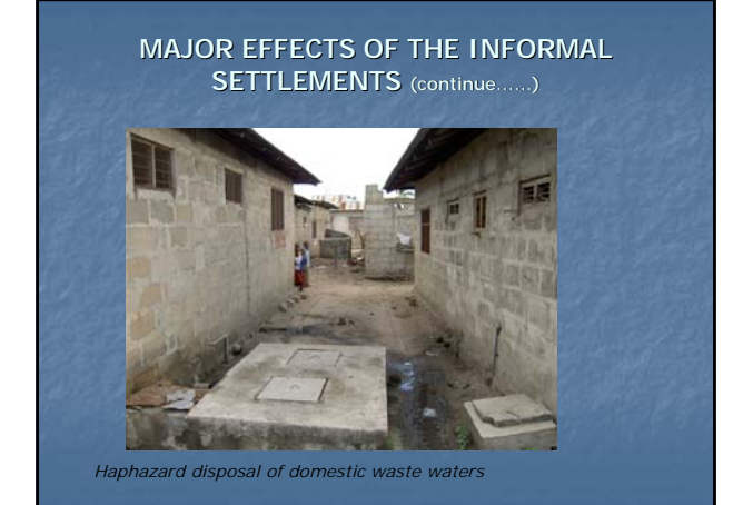
Major Effects of the Informal Settlements