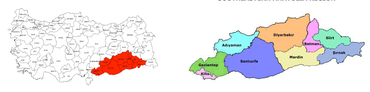
Figure 2. Provinces covered by GAP (url1).

In this project, the most important rule is sustainability. In practice, the concept of sustainability has three footholds: Participation by the State, private sector and people. The target is to consolidate State led infrastructure investments further with the participation of the private sector and people, and thus to impart all projects to the daily lives of people living in the region. This approach is not solely a reflection of a desire for fair development; It is also the result of a sound diagnosis that mobilization of existing potentials in underdeveloped regions will significantly contribute to the realization of such national goals as economic growth, social stability and boosting exports (url1).