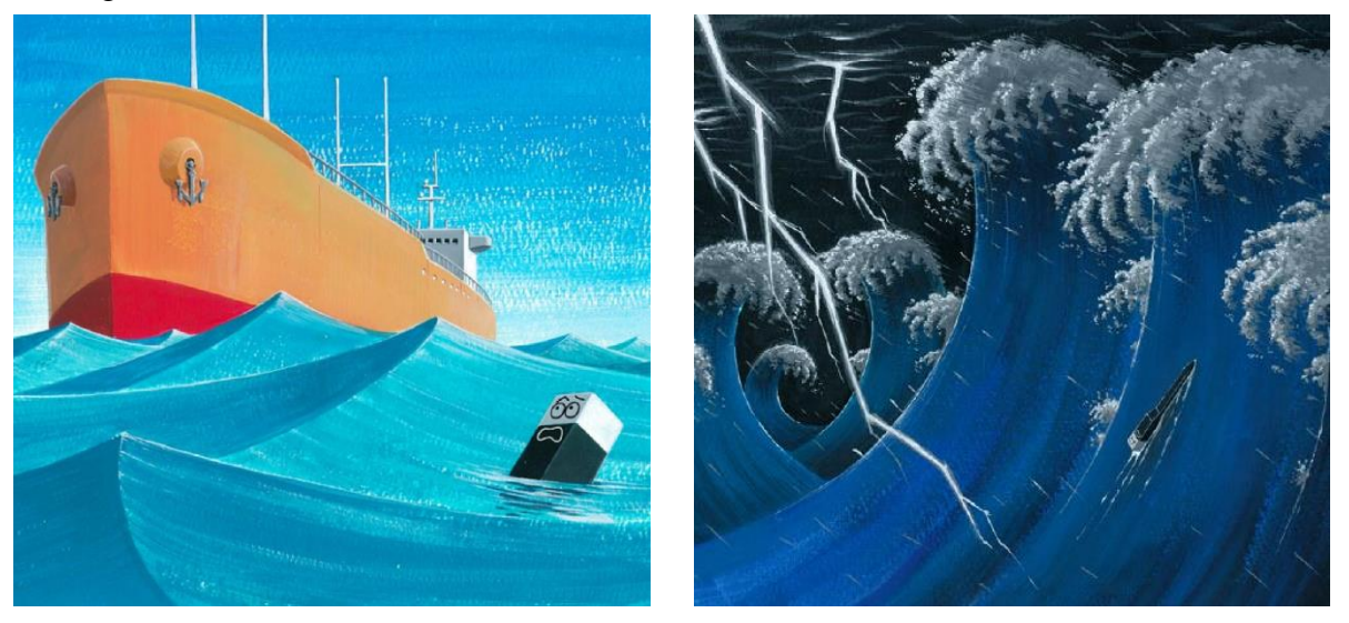
Navigating the San Juan Islands