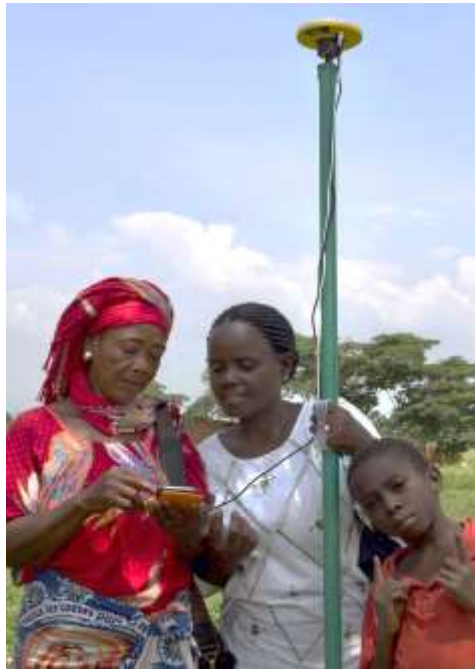
Two community members learning how to become para-surveyors using a smartphone and an external GNSS antenna to increase the positional accuracy in Luberizi, South Kivu, Democratic Republic of Congo.

having these newly qualified women surveyors join land professional organizations, they will have access to higher competences and eventually get job opportunities in the construction industry, urban and rural planning, or even conservation. Involving women in the land and surveying profession is essential, especially if we want to have women participate as full actors in the process of economic development.