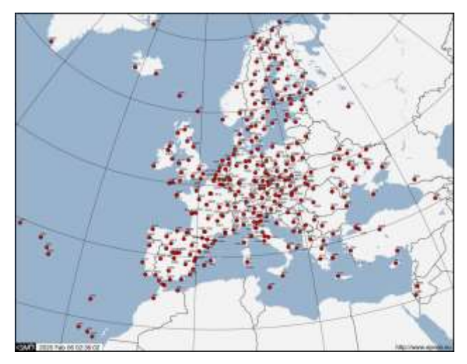
Figure 1. The EUREF Permanent Network, EPN.

The EPN provides access to the ETRS89 by making publicly available the GNSS tracking data as well as precise positions, velocities and tropospheric parameters of all EPN stations. Based on these products, the EPN contributes also to monitoring of crustal deformations in Europe, and supports long-term climate monitoring, numerical weather prediction and the monitoring of sea-level variations.