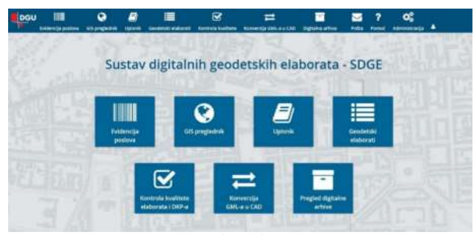
Figure 1 Initial GUI of SDGE service

SDGE is an application solution based on Web technologies, in order to be available via the Internet to all authorized surveying contractors using the basic Web browser. The system is owned by the State Geodetic Administration and developed by IGEA Ltd. The main purpose of the SDGE application solution is to provide a quality tool for digital geodetic elaborates that supports the entire process from downloading official digital data, preparation and production of geodetic studies to submission of digital studies to review and confirmation. SDGE consists of several modules (see Figure 1).