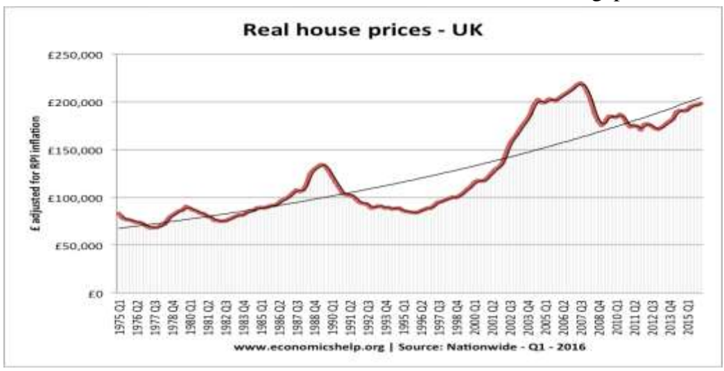
Figure 1: Percentage of purchase or personal construction of houses in some countries A World Bank study projects that the cost of bridging this 17 million housing deficit is $\frac{1}{2}$59.5 trillion, indicating the vast and untapped investment potential of Nigeria real Estate sectors. Meanwhile, currently our housing and construction sector account for only 3.1% of our rebased GDP while the total current housing production is at about 100,000 units per year for a country of about 190 million now. Therefore, Emiedafe (2015) suggested that we need at least about 700,000 additional units each year to have a change of bridging this huge gap. According to World Bank report (2008), the contribution of mortgage finances of Nigeria's Gross Domestic Product (GDP) is close to negligible with real estate contribution less than 5% and mortgage loans and advance at 0.5% of GDP.

Housing problem is peculiar to both rich and poor nations as well as developed and developing countries (Festus & Amos, 2015). Nigeria has a population of about 174 million people and faces a housing deficit of about 17 million units (Emiedafe, 2015). According to Emiedafe (2015), the implication of this housing deficit is that tenants in rented apartment pay as high as 60% of their average disposable income which is far higher than the 20-30% recommended by the United Nation. In additions, expert believe that it is only 10% of those who desire owing a home in Nigeria can actually afford it either by way of purchase or personal construction as against developed countries like 72% in USA, 78% in UK, 60% in China, 53% in Korea, 92% in Singapore.