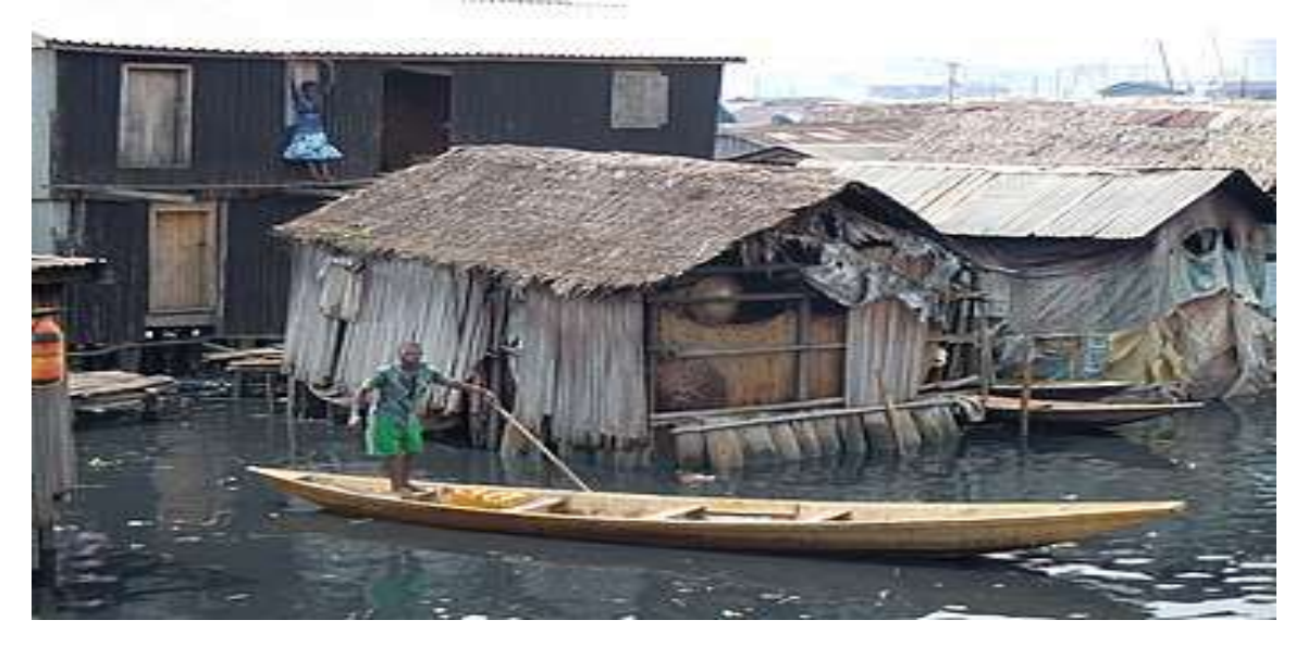
Figure 3: A slum in Makoko, Lagos State