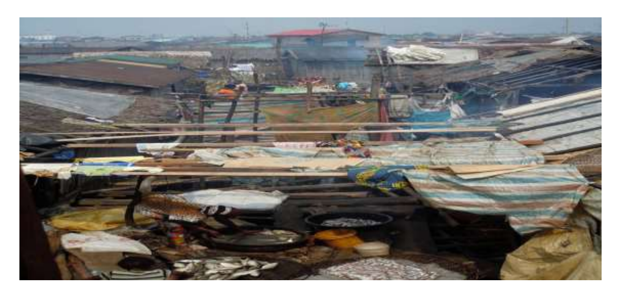
Figure 4: A slum in Makoko, Lagos State