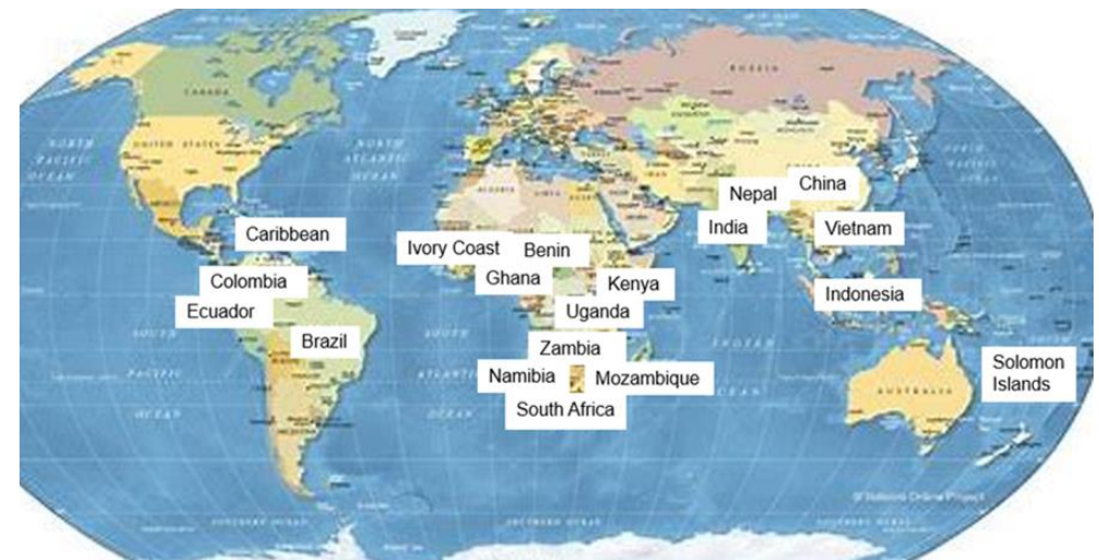
Figure 2. FFPLA Country assessment and implementation addressed in this special issue

This Special Issue provides an insight, collated from 26 articles, focusing on various aspects of the FFPLA concept and its ap-plication. It presents some influential and innovative trends and recommendations for designing, implementing, maintaining and further developing FFP solutions for providing secure land rights at scale. The first group of 14 articles is published in Volume One and discusses various conceptual innovations related to spatial, legal and institutional aspects of FFPLA and its wider applications within land use management. The second group of 12 articles is published in Volume Two and focuses on case studies from various countries throughout the world, providing evidence and lessons learned from the FFPLA implementation process.