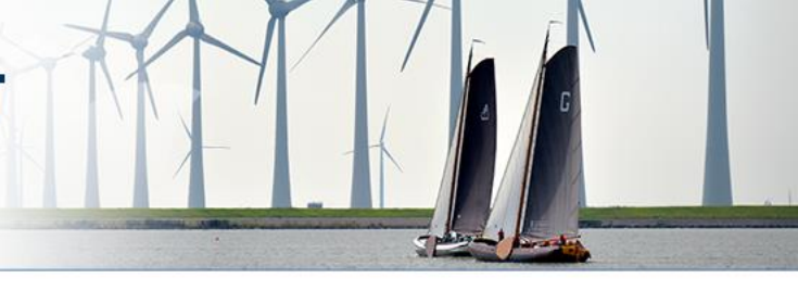
FIG Member Association and Regional Bodies Forum