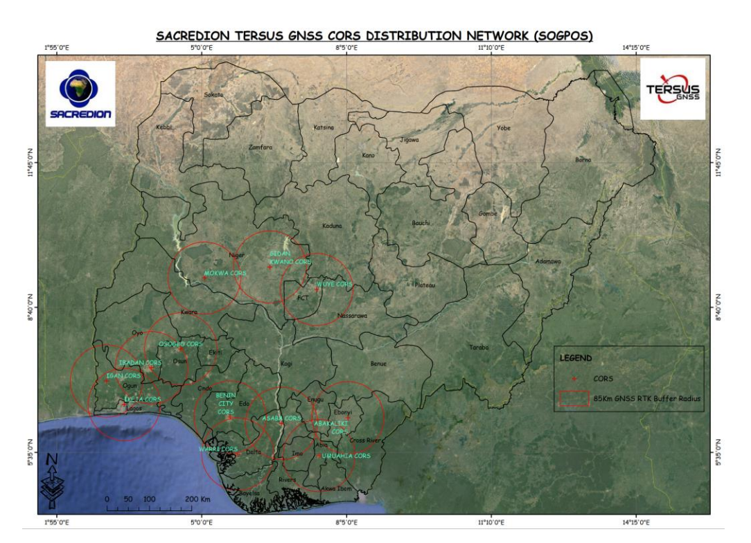
Figure1: Locations of SOGPOS CORS (adapted from Google Earth)