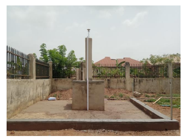
Figure 2: Tersus Smart AXE402 GNSS Antenna, SOGPOS Osun CORS in Osogbo (APPSN Osun State)