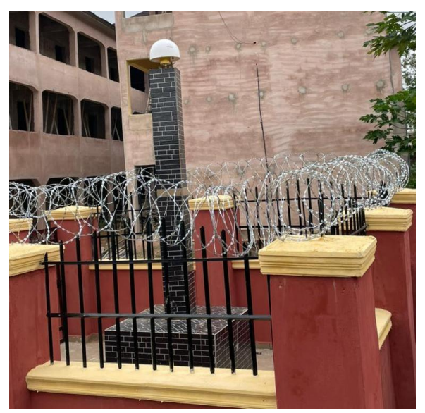
Figure 4: SOGPOS Abakaliki CORS Monument (Tersus AX3707 Choke Ring Antenna)

With the Tersus GeoBee CORS receiver, antenna and router in place, Tersus GNSS provides NTRIP Caster for transmitting RTK correction via Internet Protocol for applications such as surveying, agriculture, UAV, machine control, etc. It is also ideal for deformation monitoring.