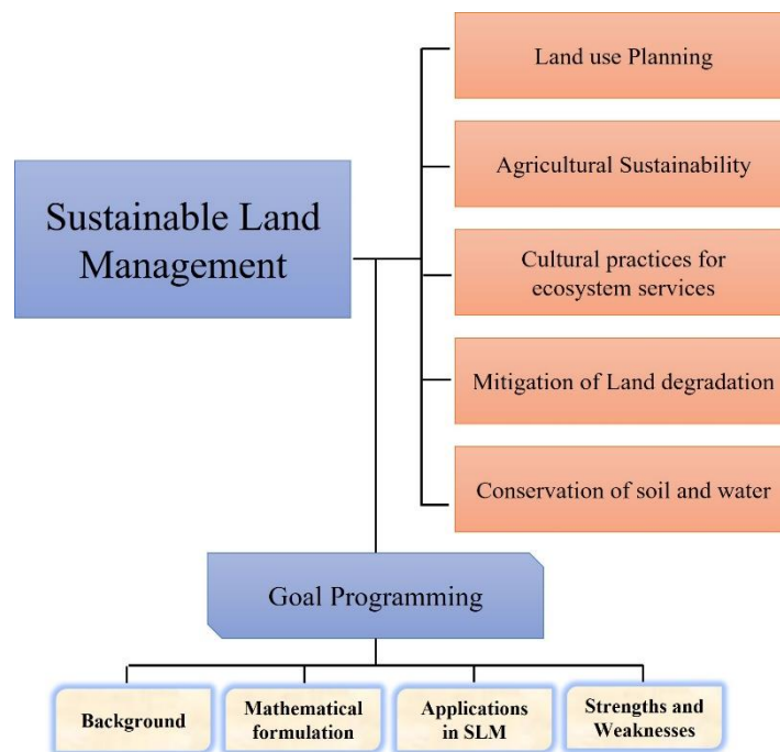
Figure 1: Framework of the study’s Methodological design

is chosen and discussed extensively based on its historical background, how it has featured in the academic literature relating to SLM, its strength and weaknesses along with how it is being formulated and applied in SLM. These themes are the focus of the next sections of this paper.